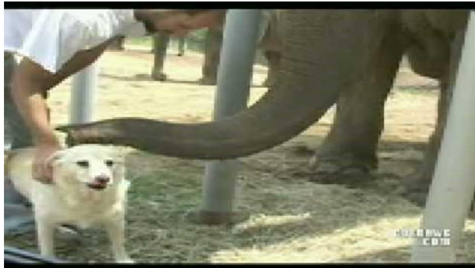
Tarra & Bella